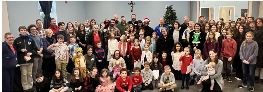
Blessed Trinity Parish Children's Christmas party.