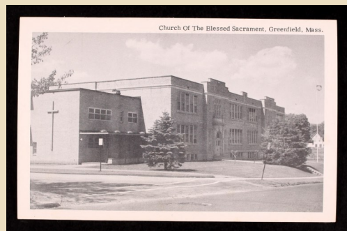
Photo from the 1960's before the current building was built.